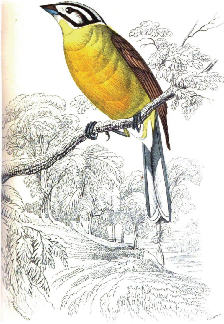
YELLOW BELLIED OR CAPE BUNTING.